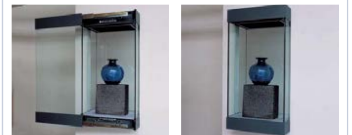
Showcases Recessed and Face Mounted Solutions, above from left; Open, Secured

The permanent solution to your temporary problems™