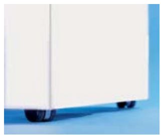
Retractable Undercarriage (Unit raised)