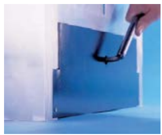
Exposed Undercarriage and Key Mechanism (Unit raised)