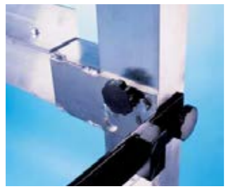
Clip Fit Connections